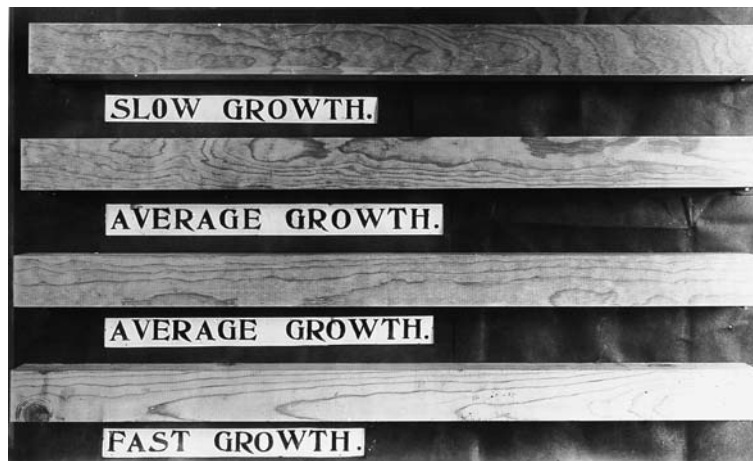
FIG. 2 Tangential Surfaces of Bending Specimens of Different Rates of Growth of Jeffrey Pine 2 by 2-in. (50 by 50 by 760-mm) Specimens

occur during final preparation of specimens, the specimens shall be reconditioned to constant weight before test. Tests shall be carried out in such manner that large changes in moisture content will not occur. To prevent such changes, it is desirable that the testing room and rooms for preparation of test specimens have some means of humidity control.